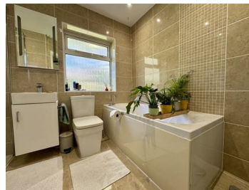
BATHROOM 7'5" x 8'11" (2.27 x 2.74) Fully tiled bathroom featuring a white suite with panelled bath with chrome mixer and spray. White gloss vanity unit with wash hand basin and chrome mixer. Large shower enclosure with fitted shower and glass screen. WC. Upvc double glazed windows. Wall cabinet. Chrome heated towel rail. Radiator. Under floor heating.