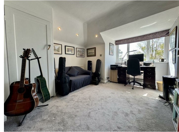
BEDROOM 4 11'6" x 9'10" (3.52 x 3) Radiator. Upvc double glazed window. Access to the eaves loft space.